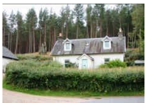
Fig. 2 : Formerly existing cottage