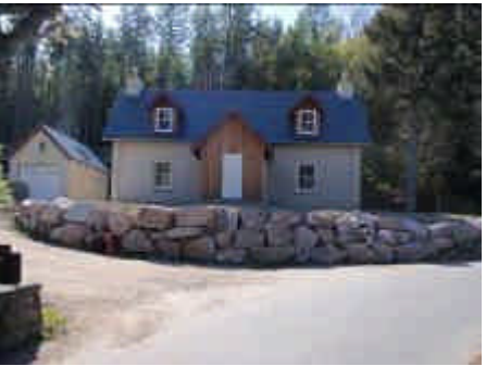
Fig. 3 : New dwelling and garage