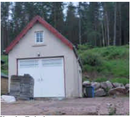
Fig. 6 : Existing garage