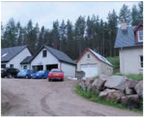
Fig. 5 : Position of garage relative to the neighbouring property